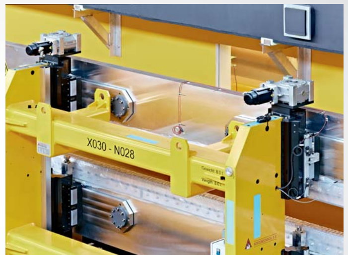
A total of four AM3052 servomotors per undulator cell – controlled via TwinCAT NC PTP – ensure that the magnet structures are precisely positioned. (The image shows the two motors of the upper magnet structure)