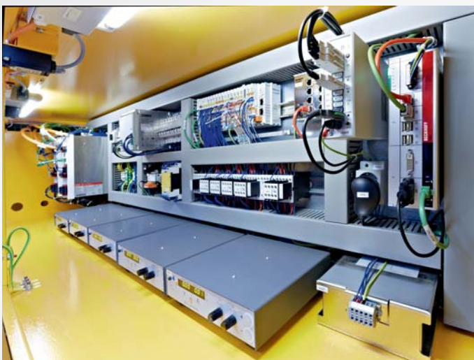
Each of the 91 undulator cells is controlled via PC-based control. The system features a C6925 control cabinet PC (right), numerous EtherCAT Terminals (center), and two AX5206 Servo Drives (left).

The high-performance TwinCAT software with integrated Motion Control functions offers a wealth of benefits, as Dr. Suren Karabekyan explains: "TwinCAT enables the implementation of a high-precision, very dynamic drive control