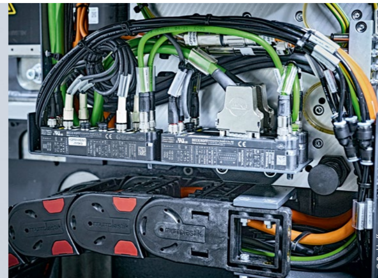
The wide I/O spectrum of IP20 EtherCAT Terminals and IP67 EtherCAT Box modules (here: EP2338 and EP5101 in the BLS 500) facilitates the modularization of Manz systems.