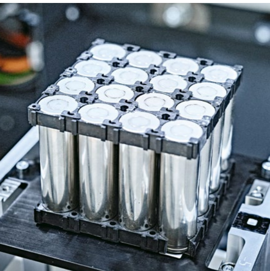
Example of a lithium-ion battery module constructed from round battery cells