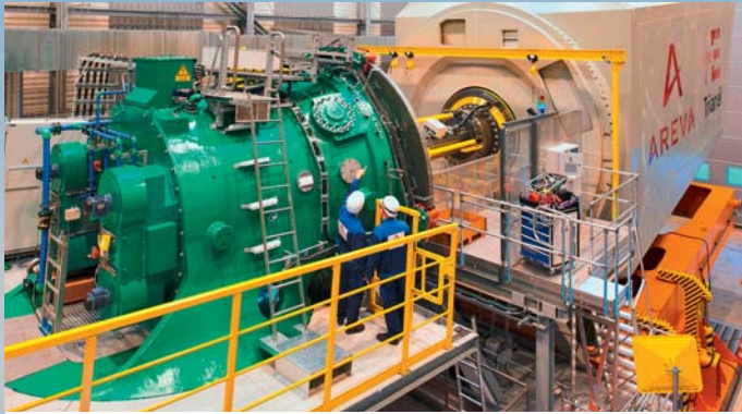
In the full-load test stand, which is equipped with PC-based automation technology from Beckhoff, each Areva M5000 offshore wind turbine is subjected to extensive tests.

compliance with the current grid requirements. During the test phase the wind turbines are monitored with a Scada system integrated in the controller. The data from each test point are entered into databases and represent the first operational data during the lifetime of the turbines. The company operates in twelve-hour shifts, in order to be able to test two turbines per week. Once the tests have been completed successfully, the tasks involved in commissioning the wind turbine are reduced to a minimum, which means that the failure rates and the associated economic risks are reduced significantly.