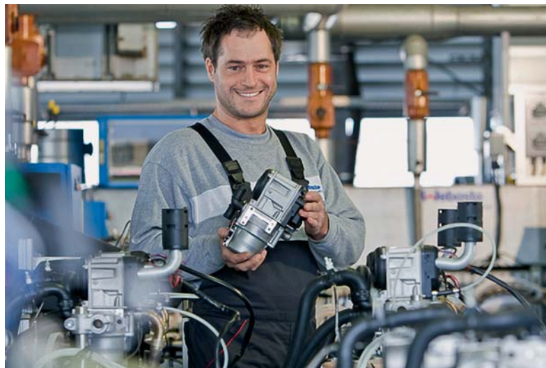
The Thermo Top Evo heaters from Webasto represent the next generation of car parking heaters. They ensure rapid de-icing of windshields and a pleasant temperature inside the car.

The Webasto group, with headquarters in Stockdorf near Munich, has been a family-owned enterprise since it was established in 1901. The group now has more than 50 international locations (of which more than 30 are production locations) and operates in the business segments of roof and thermo systems. Webasto is one of the 100 largest suppliers to the automotive industry worldwide. In 2010 the group generated a sales volume of 2 billion euros with more than 8,500 staff. Core competencies include development, production and distribution of complete roof and convertible roof systems, heating, cooling and ventilation system for cars, motor homes, boats, as well as commercial and special-purpose vehicles.