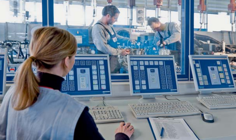
In the control room, the centerpiece of the endurance test facility, all measurement values from the test processes are logged at high speed and visualized.