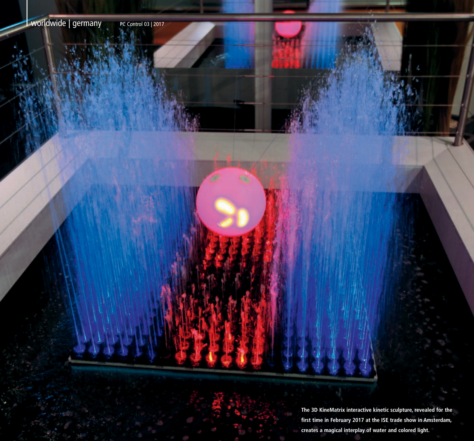
The 3D KineMatrix interactive kinetic sculpture, revealed for the first time in February 2017 at the ISE trade show in Amsterdam, creates a magical interplay of water and colored light.

Kinetic sculpture interacts with water and light