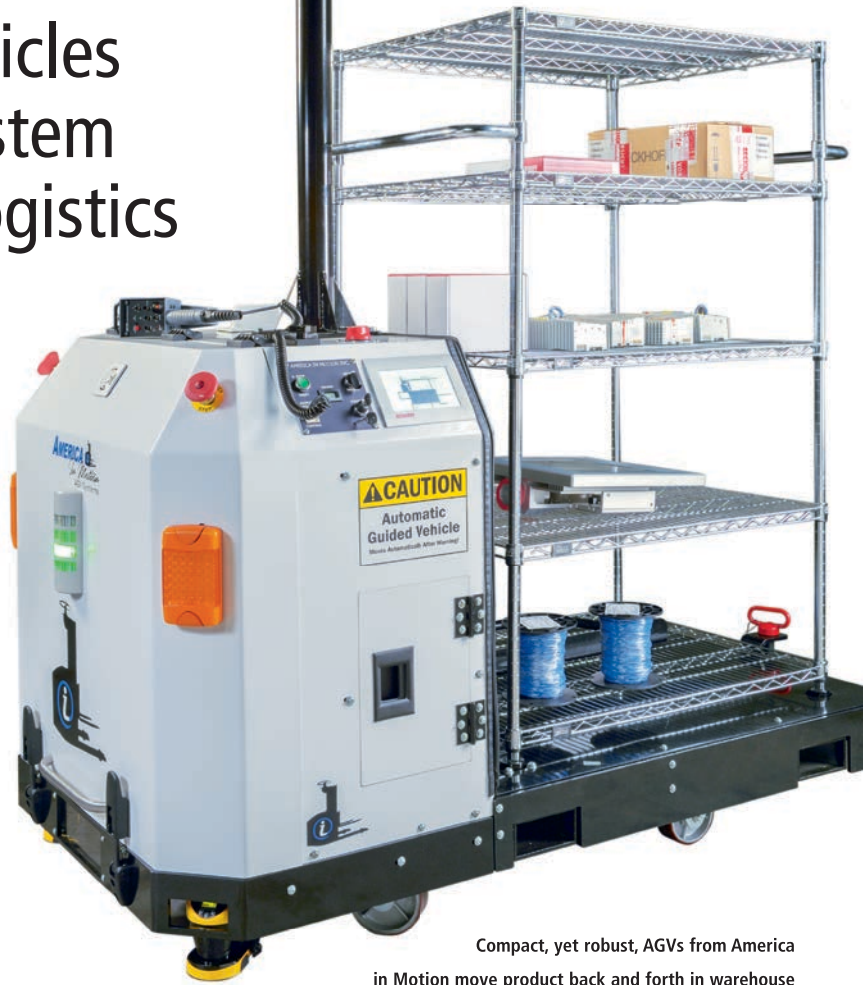
Compact, yet robust, AGVs from America in Motion move product back and forth in warehouse applications with little or no operator intervention.

The fantasy that once typified automatic guided vehicles (AGV) in science fiction has become a tangible reality today, such as in warehousing operations. With the new iBOT series, America in Motion is breaking new ground, since the transport vehicles are equipped with a revolutionary path planning system.