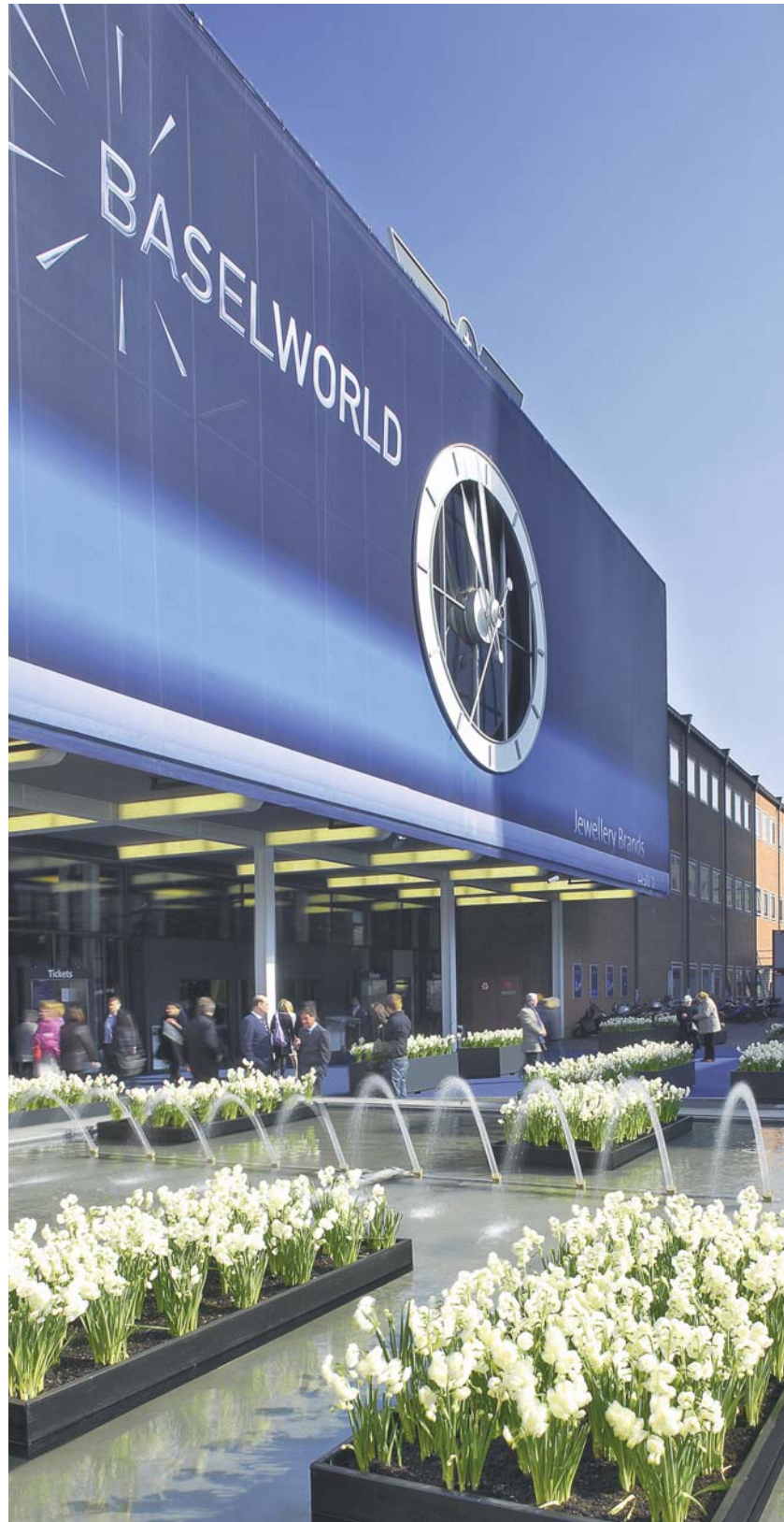
Exhibition Hall 2 during the Baselworld, the world's leading trade fair for watches and jewelry. The Messe Basel also hosts Switzerland's most important automation trade fair, Go-Automation.

The large numbers of visitors and the competitive situation among exhibition centers made the replacement of the building services by more efficient technology unavoidable. Within the scope of planning