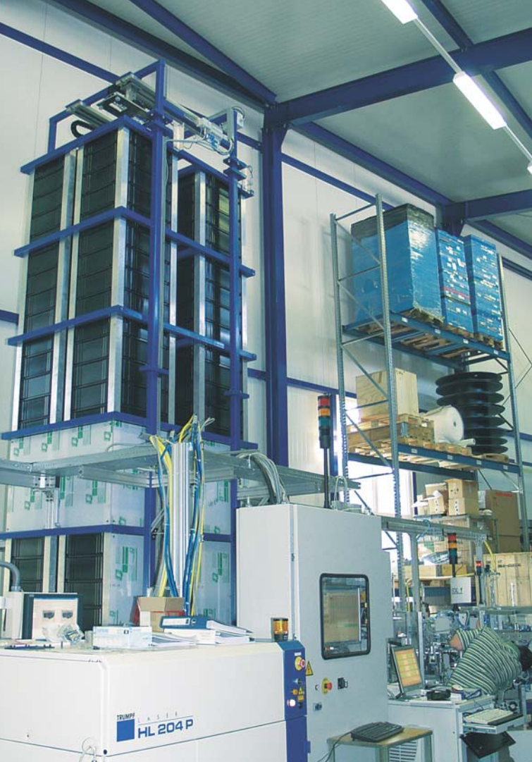
The new Pollmann production facility during the test phase at the Karlstein factory: in the foreground, the laser welding machine by Trumpf, in the background, the 4 meter high storage tower that serves for the curing of the cast parts coming from the two-component casting station. At the same time, it is used as a buffer store within the overall production process.

→ For a few months now, newly installed production facilities built by the Austrian automotive supplier, Pollmann have been running at full speed in China. There, this specialist in electromechanical subassemblies manufactures, among other items, gearboxes used in the automotive locking systems of a well-known, global car manufacturer. The production plant was developed, designed and built by Pollmann and then, after an intensive test run that included pre-series production, shipped to China at the end of 2007. For the control system the company relied on its partner of many years, Beckhoff, developing a smart, locally arranged PC- and Ethernet-based automation architecture.