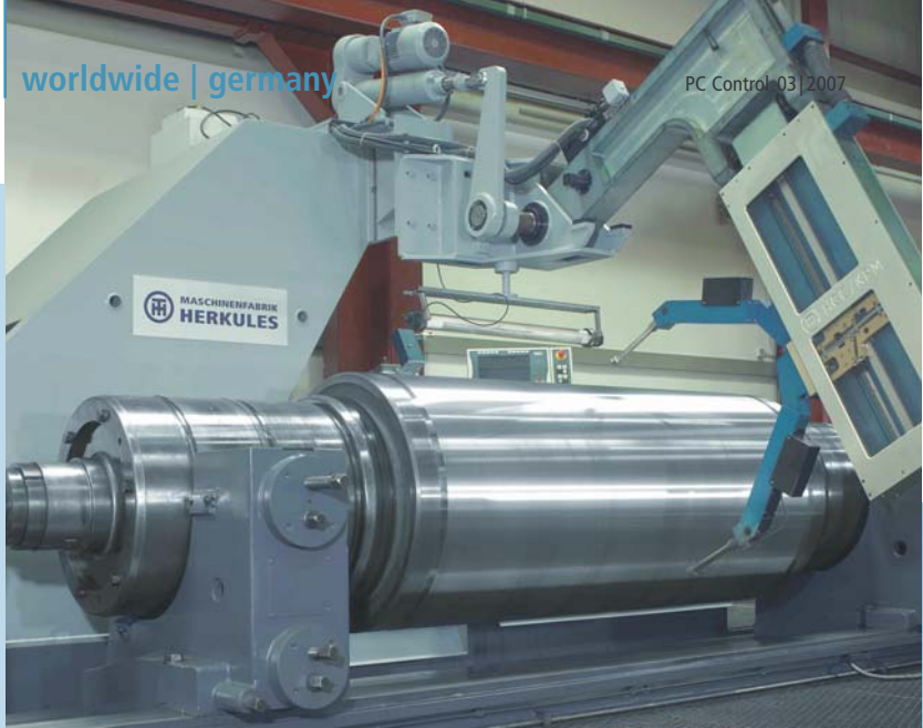
Herkules roll grinder type WS 600. The rollers to be machined can weigh up to 400 tons and measure up to 10 meters in length.

The input to the machine is made via a Control Panel, which was designed and planned jointly with Herkules in line with their particular needs. All hardware operating elements integrated in the panel are linked to the control PC via Lightbus. This compact and highly integrated operating design enables stationary machine management and the implementation of the mobile support control station. The HCC Graphical User Interface (GUI), with which the operator adjusts and operates the complex machine, is visualized on the panel. The operator obtains all the information about the roller and the current grinding status via the GUI. The link from TwinCAT to the multilingual GUI takes place via ADS-DLL, the versatile communication interface from Beckhoff.