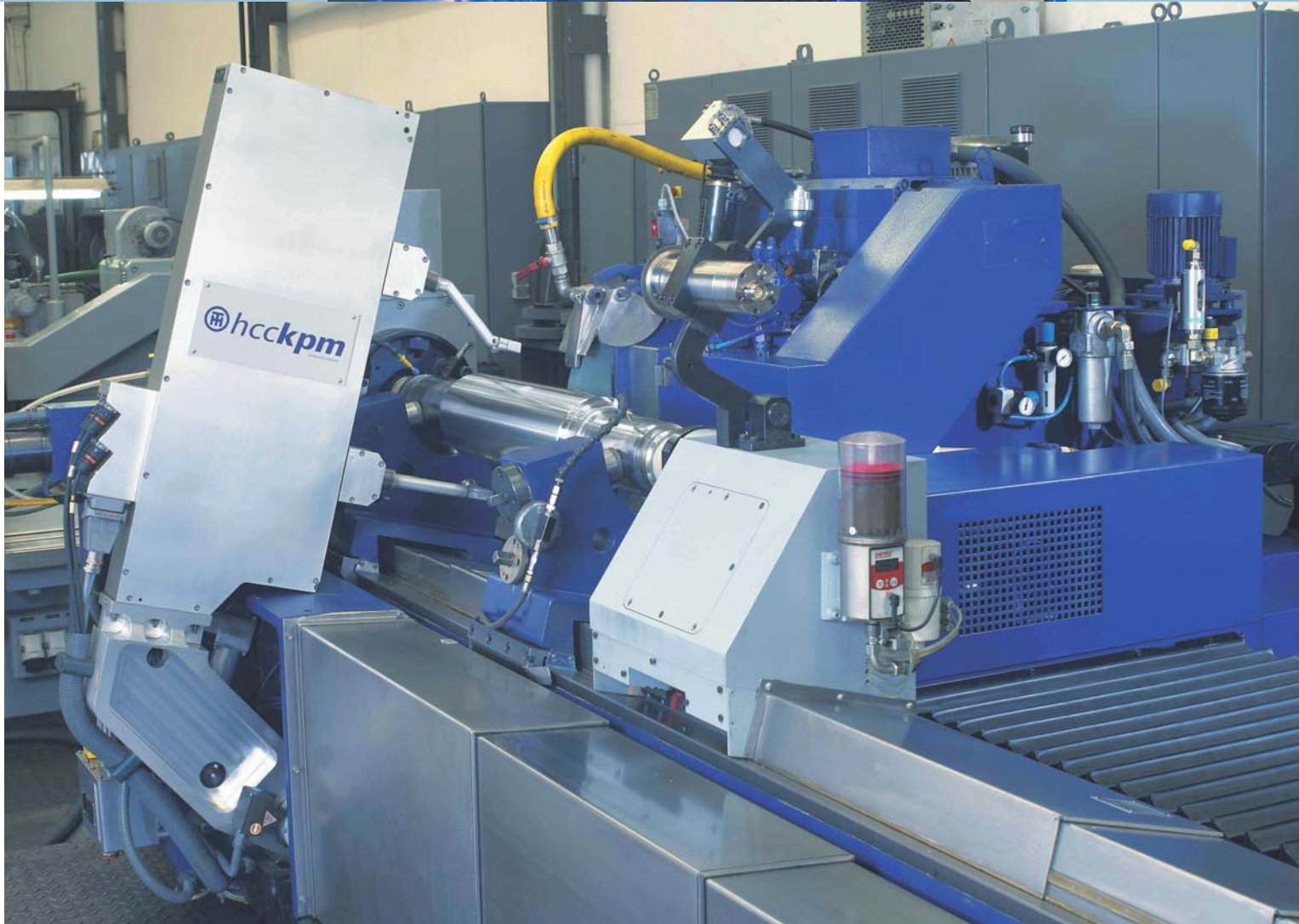
Herkules roll grinder type WS 450 L Monolit™

grinding process from these parameters. Continuous measuring is carried out simultaneously in order to record the results of the grinding process and determine or correct the required values for the next travel.