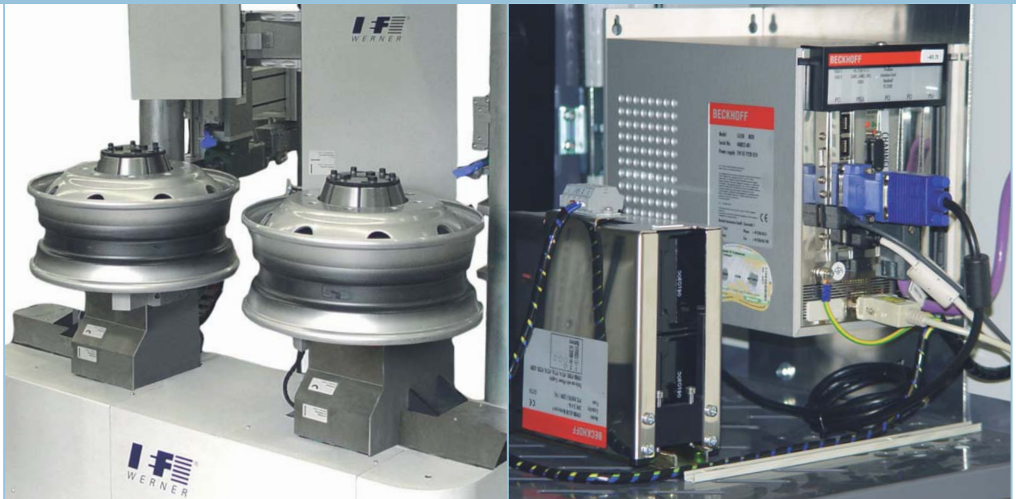
PC-based control system for wheel gauging machine R2010 made by IEF Werner GmbH

→ Thanks to leading edge control technology from Beckhoff, wheel gauging systems made by IEF Werner GmbH are able to record the geometrical features of wheels of every kind (cars, trucks, tractors) with high precision in an exactly reproducible way. Even dimensions with minimal tolerances can be measured precisely and reliably. As a result, IEF Werner wheel gauging systems can fulfill the demanding requirements of the automotive industry.