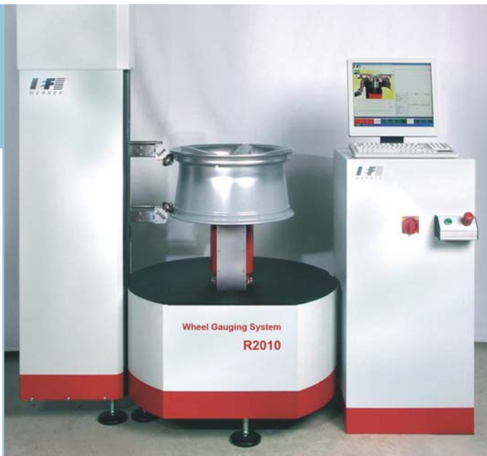
The wheel gauging machine R2010 for car wheels operates quickly, precisely and with accurate reproducibility thanks to leading edge PC-based control technology.

The PC-based control system enables the integration of additional Windows-based applications e.g. special measuring software. The measuring software visualizes the comparison between the measured and target dimensions, in a bolt hole positioning diagram, for example.