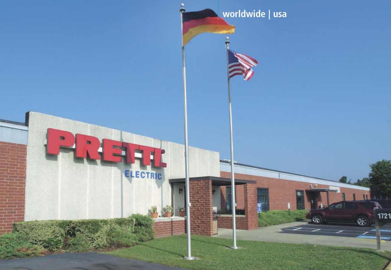
The US facility of Prettl Electric in Greenville, South Carolina.