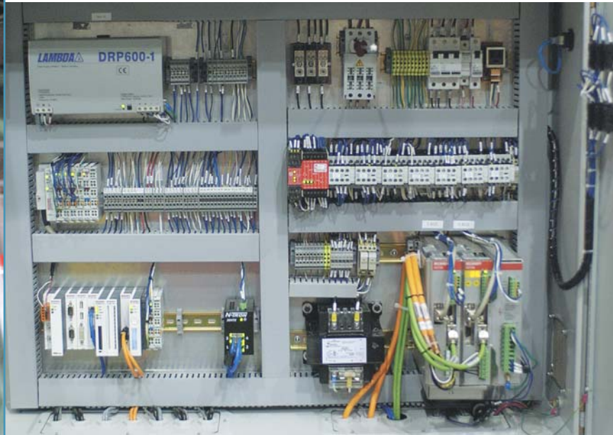
The pick and place machine features compact Beckhoff AX2500 servo drives that are networked with the CX1000 via CANopen.