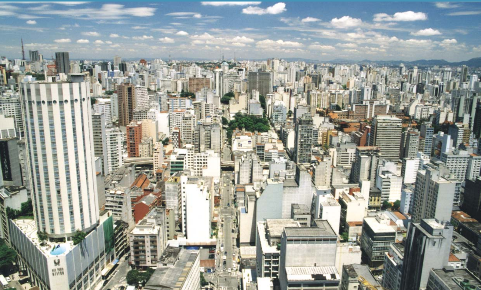
São Paulo is the capital of São Paulo State in Brazil.