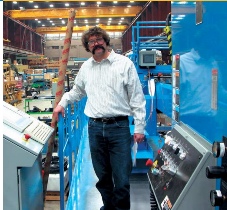
The MarquipWardUnited control system features a C6240 Industrial PC running TwinCAT software and a Lightbus PCI card that connects to high-speed Lightbus distributed I/O.

Having a technology migration path was an important ingredient in MarquipWardUnited’s decision-making mix. “We are a vertically integrated company and typically have had to invent most of the components on our machines. We were looking for an off-the-shelf, open system so we could connect to different systems if necessary. We needed something that was simple enough to use, but at the same time, gives us a technological and competitive edge – we found it in Beckhoff,” he said. “IEC 61131-3 is a standard that ensures if things change you can program on other hardware later and can always support older hardware.” Virtually every sheeter is customized in one way or another. “Because of our control flexibility, openness and power, MarquipWardUnited is able to meet a multitude of different requirements at a reduced cost.” The switch to Beckhoff technology has meant lower costs for MarquipWardUnited on several levels. How-