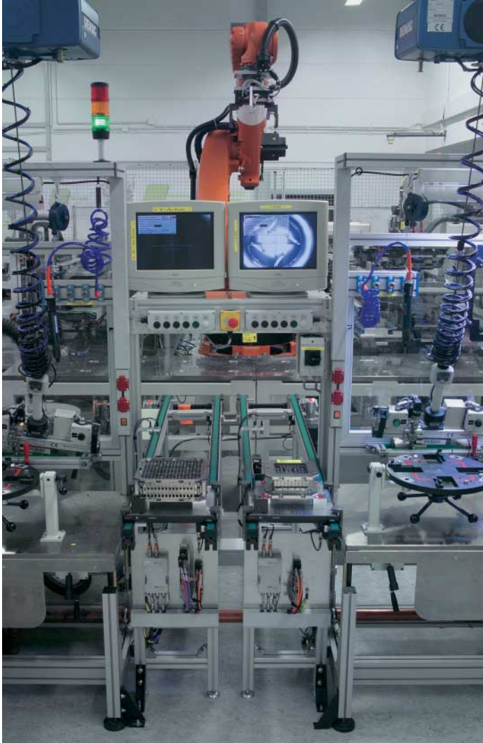
Overview of the plant: Both welding chambers are equipped with a welding laser, a camera system and a visualization PC at the control unit. A Kuka robot handles the steel grids.