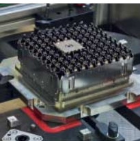
The 19-inch slide-in PC from Beckhoff serves as control PC on which the TwinCAT NC I automation software runs.

For Peter Blomberg, the main benefits, particularly from TwinCAT, are simple and convenient handling and fast installation on the computer. "Within half an hour we can convert the PC into a real-time PLC and motion control system. Hardware independence is another attractive feature – in theory, we can use any PC as a platform for the software system," he said. "The simulation options also offer significant benefits. We were able to fully model the plant in advance on the PC." This saves time and avoids surprises during commissioning on site. Moreover,