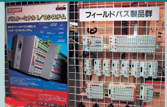
"New Automation Technology" from Beckhoff at the System Control Fair in Japan.