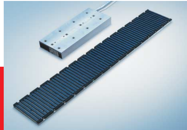
Reinforcement for drive technology: new linear motors for peak forces up to 9000 N.

automation technology should also be able to penetrate the previously separate market of measurement technology. "The signs for automation companies are good, since many metrological tasks can be solved quite easily using automation technology." At the same time, he is convinced that instrument technicians can deal with automation tasks without significant effort.