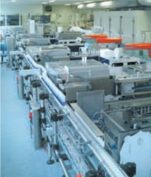
Overview of thermal area

the milk is pumped into the tank truck, and the supplier data are written to transponders installed in the base of the bottle". These so-called RFID tags have unique ID numbers for identifying the samples during the subsequent testing steps.