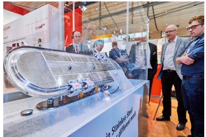
The stainless steel version with IP 69K protection rating now opens up the XTS to application areas in which the demands made on hygiene are high.

The mechanical components used in the XTS are made of V4A stainless steel, while the seals and covers consist of very resistant plastic materials. In addition, all the joints between the individual components are protected against the ingress of dirt and liquid by a high-quality, elastic joint seal. Once installed, the XTS components form an even, smooth surface together with the machine that is easily accessible in all areas, which also makes it very easy to clean. These properties also apply to the movers, with the rollers placed at such a distance to the mover's body that the gap can be cleaned with e.g. a finger. The rollers of the mover are sealed against the axis in such a way that it is possible to reliably prevent the ingress of dirt and any leakage of the bearing grease.