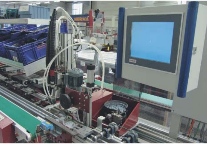
Assembly station for the installation of the toothed belts in the guide rail, with Panel PC CP6201-001