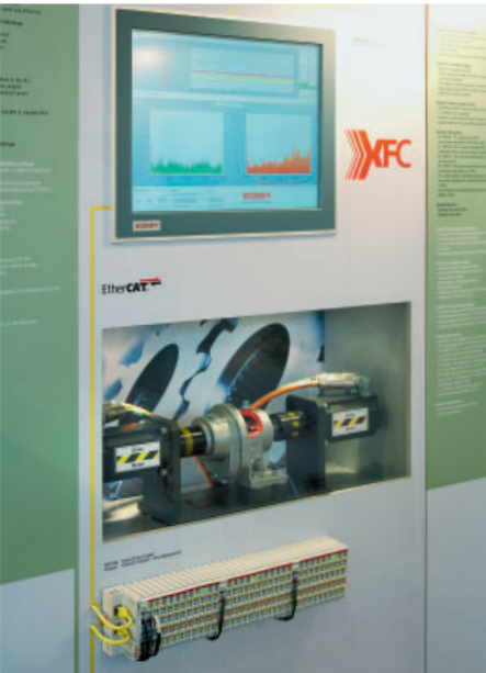
Hanover Fair 2009: Condition Monitoring solution with EL3632 EtherCAT Terminal