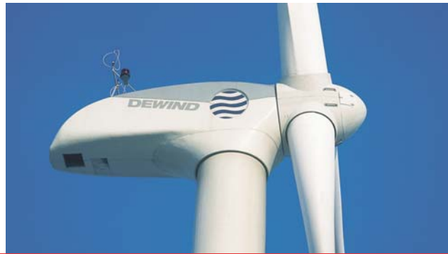
The prototype for the DeWind D8.2 was commissioned at Cuxhaven, Germany, in January 2007.