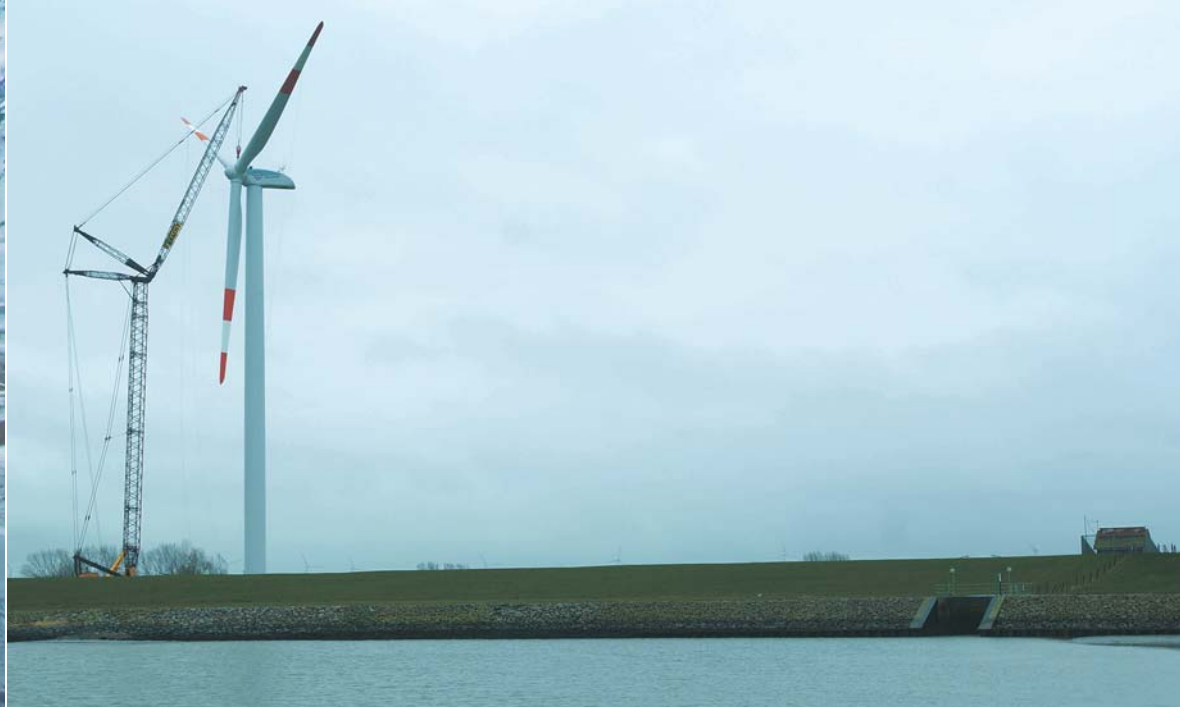
DeWind D8.2 in the Argentinean Andes at an elevation of 4,300 meters (over 14,100 ft)

quency on the grid side. The design enables DeWind to build systems that can be used economically onshore in areas with relatively low wind speeds. Systems of this type are successfully sold in Europe.