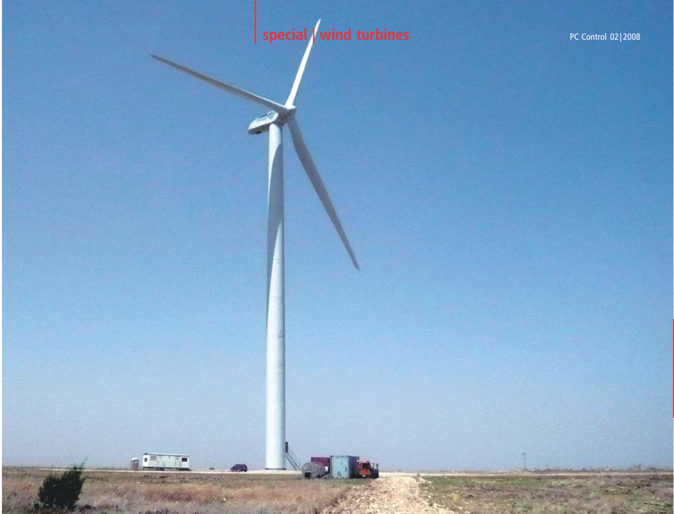
A 60 Hz version of the DeWind D8.2 was built in Sweetwater, Texas, in March 2008.