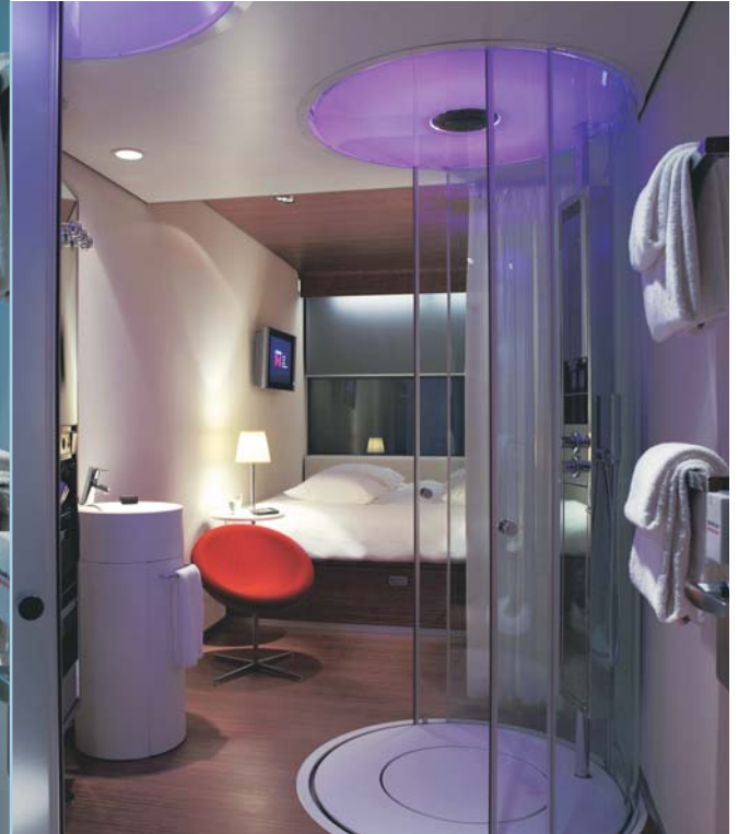
Each hotel room is fitted with LED lighting. The color can be changed for different lighting scenes.