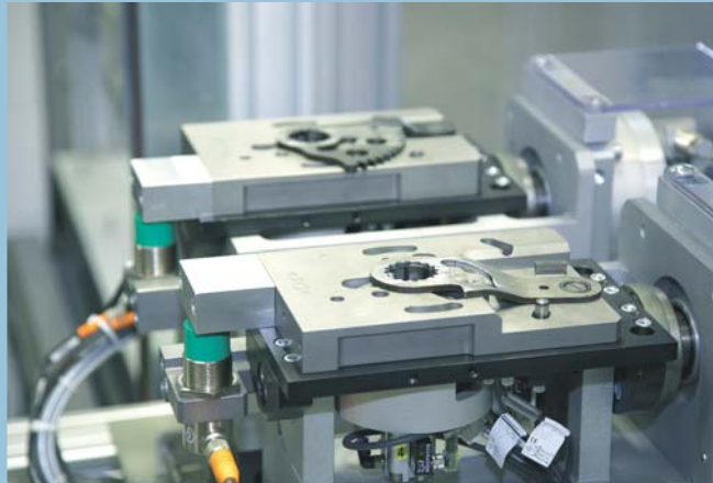
Automatic material feed to the machine

The machine has a modular structure with three main and two auxiliary stations. The parts are advanced through the machining stations by a servomotor-driven handling device. The cycle time for an assembly needing three swaging processes amounts to about 8.5 seconds per assembly.