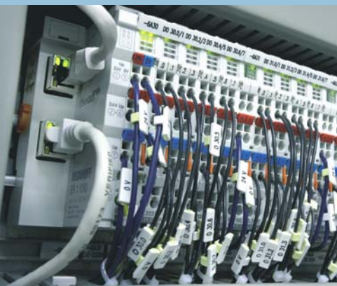
EtherCAT-based automation: AX2000 Servo Drive with EtherCAT interface (left) and EtherCAT I/O Terminals

230 bar. Olaf Klink points out: "It is particularly important to monitor the hydraulic temperature. A complete temperature module is coupled to the Embedded PC via EtherCAT for this purpose."