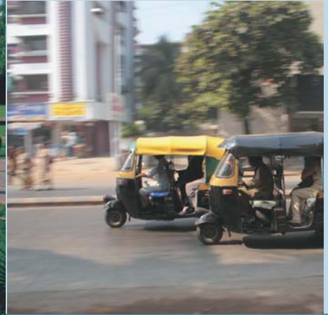
From left: skyline of Mumbai, Taj Mahal and motor rickshaws