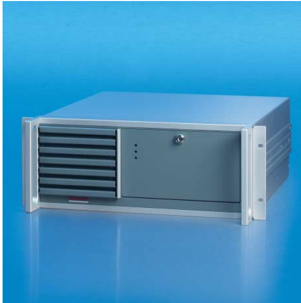
Four of Radiator Specialty's filling and packaging lines are controlled by Beckhoff C5102 or C6320 PCs.