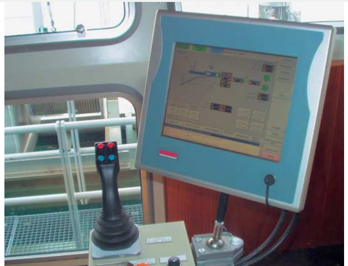
Each unit of the suction dredger can be controlled via the visualization system on the dredger or from land.

Communication between the individual DredgerTec systems takes place via the TwinCAT ADS interface. All connected systems access the same master data. The visualization is based on the Visual Studio.Net development environment. Depending on the application, the visualization is done on an Industrial PC, Panel PC or an additional PDA hand terminal. Communication with the TwinCAT system of the suction dredger takes place via TCP/IP and copper, optical fiber or wireless LAN connections.