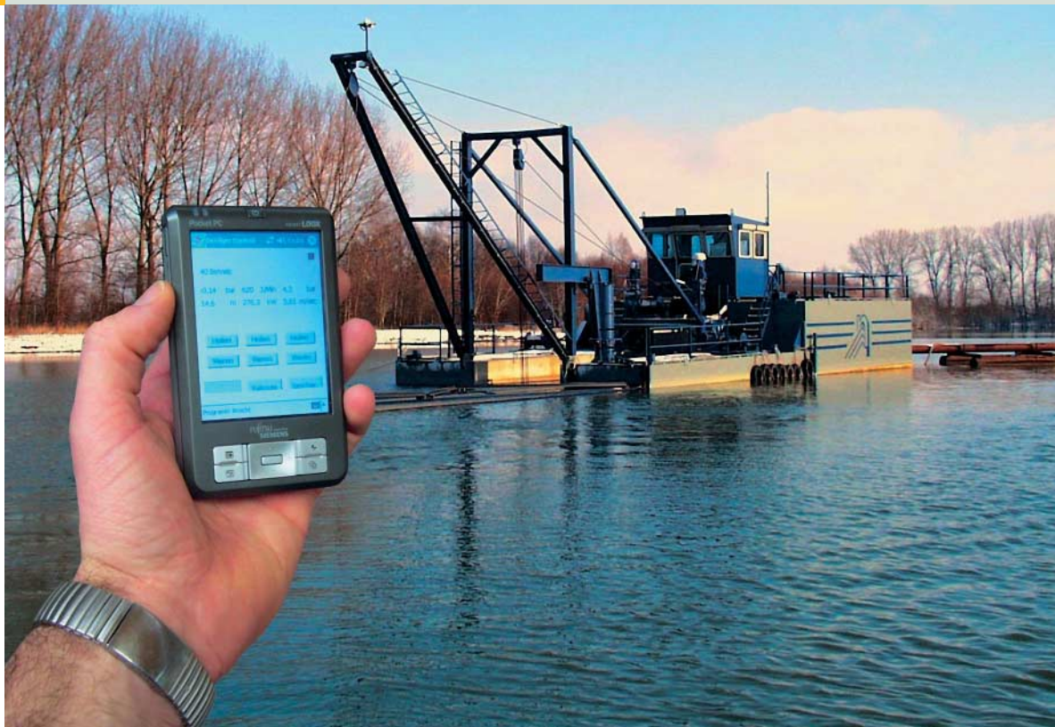
The suction dredger "Werthersechte" can be controlled remotely via a mobile hand terminal.

The automation technology aboard the suction dredger ship, "Werthersechte" was recently modernized to improve cost-effectiveness while reducing wear-and-tear and energy consumption. Pilot-less automatic operation of the suction dredger was achieved with the DredgerControl system from German company Team GmbH, based on Beckhoff Bus Terminals and TwinCAT software. The monitoring system enables all dredger components to be visualized and controlled either from the dredger or from land.