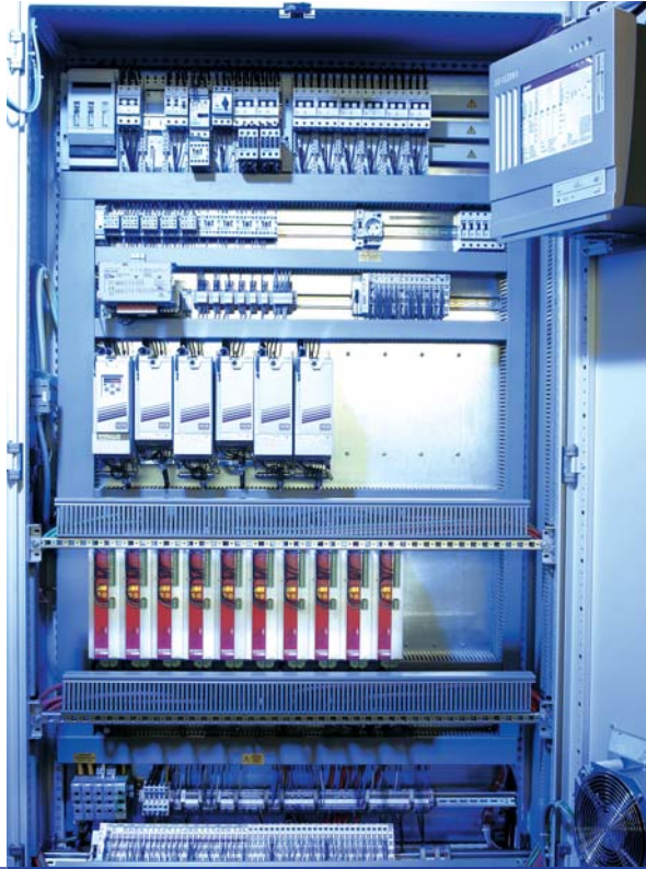
One of 3 control cabinets with Beckhoff Bus Terminals, Servo Drives and C6140 PC Controller with 2.4 GHz Intel Pentium 4.