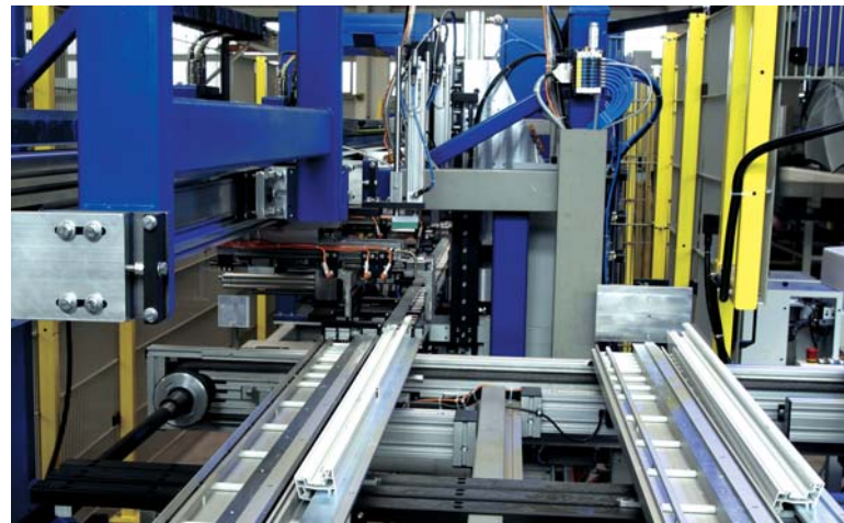
Buffer for cycle-independent conveying of workpieces.