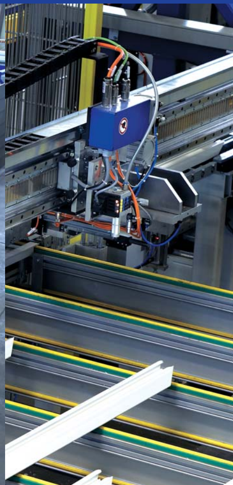
Complex tongs for conveying a wide range of profile types.