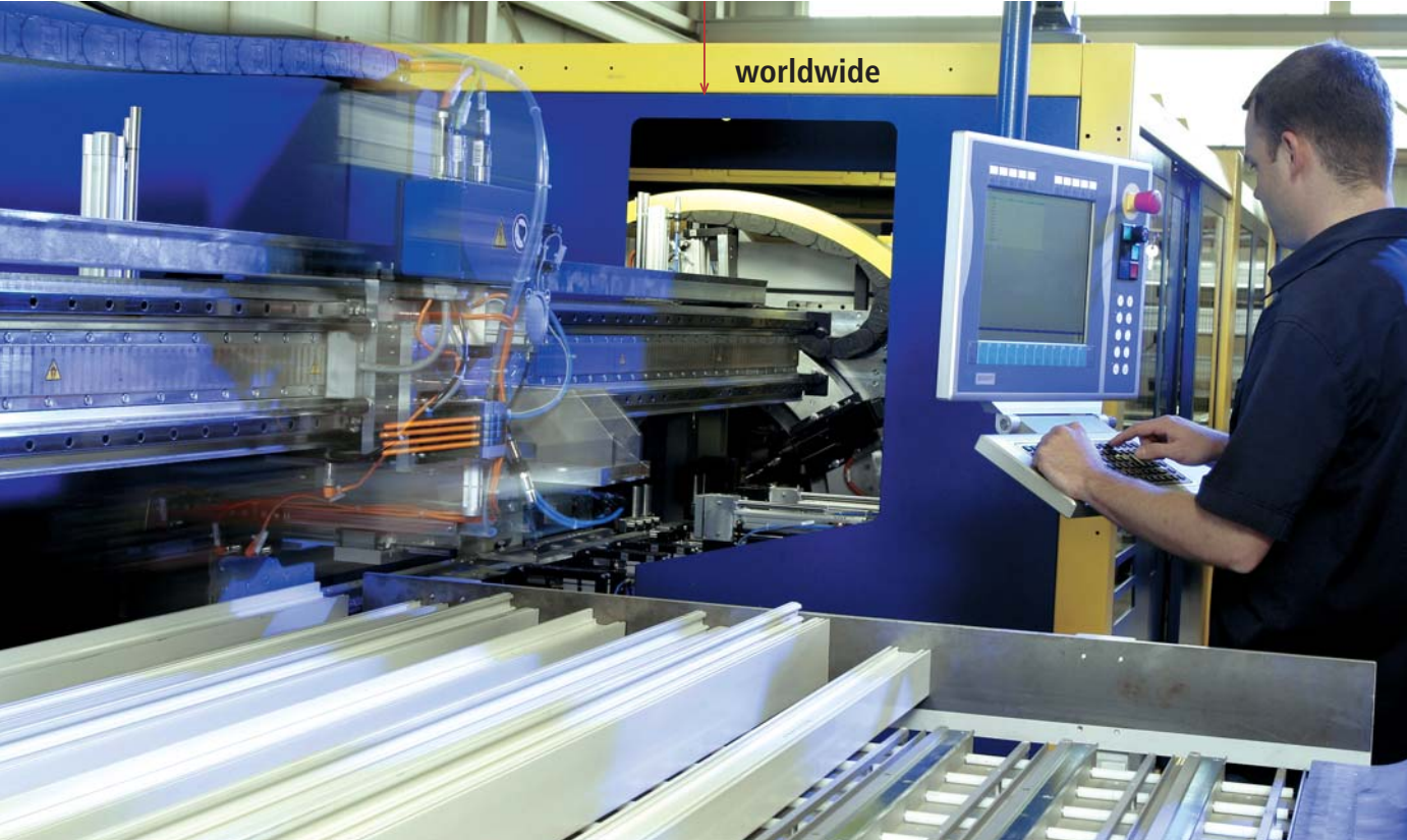
The whole system is controlled via a CP7012-1011 Control Panel from Beckhoff.

NC-controlled 4-axis module for freely programmable PVC machining.