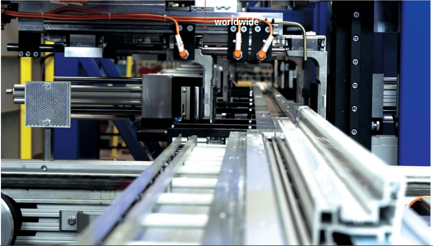
Complex counter profile guide for a wide range of profile types.