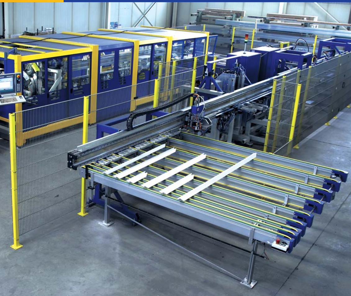
High-performance cutting and processing center from Schirmer.

→ The machining of window profiles leads to stringent requirements for machine and automation engineering if high flexibility, quality and cost-optimized production are called for. A mutual exchange of know-how between the machine manufacturer and the control supplier is vital for applications such as these. Optimum co-operation, as practiced between Schirmer and Beckhoff over many years, can lead to high-end solutions such as the profile machining systems from Schirmer, for which Beckhoff contributed more than just pure automation engineering.