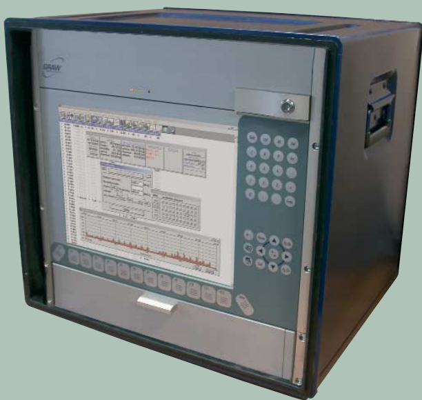
The customized C3340 built-in Industrial PC is used as a mobile ground station.

The central component of the ground station for receiving the sonde data is the customized C3340 built-in Industrial PC from Beckhoff. The standard motherboard was replaced with an ATX Pentium 4 board with ISA slots, since the two special plug-in cards used in the system (400-MHz receiver, radiosonde interface for take-off preparation) require this ISA bus, which is no longer supported as standard. Beckhoff realized the complete customization of the front, the re-routing of the USB connection to the front panel and the integration of an electric on/off switch very quickly and flexibly. Florian Schmidmer, general manager from Graw Radiosondes GmbH & Co, said: "A major reason for the decision to use the Beckhoff IPC was that the C3340 offers drives that are accessible from the front and lockable as standard."