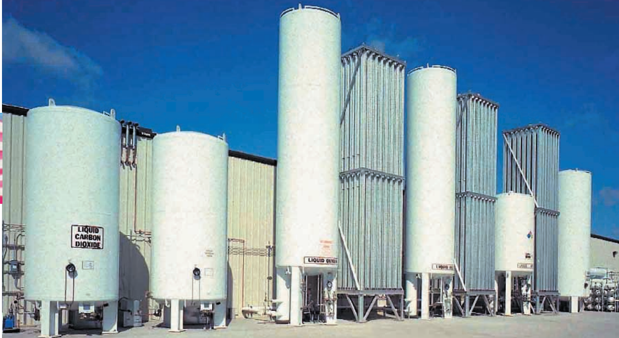
Linweld is one of the largest independent suppliers of welding, medical and specialty gases in the USA.

→ CTR, Inc. is a company in Rock Hill, SC, that designs and builds industrial gas plants for customers who supply high-pressure bottles of welding and medical gases. Since 1992, the company has constructed gas plants in Minnesota, Oklahoma, Nebraska, Alabama, Illinois, and New Mexico, and projects are under construction in Ohio and California. As a leader in cylinder fill plant equipment design and manufacturing, CTR relies on products from Beckhoff USA to help them automate the operation of the completed plants that CTR builds for its customers.