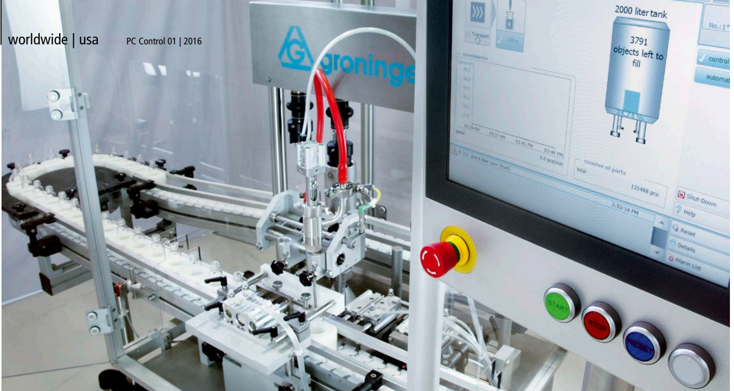
The filling system of the lite-F used Groninger's proven positive displacement pumps for high-accuracy applications.

The machine portfolio of Groninger covers a broad spectrum of functionalities that includes not only the actual filling process, but also the cleaning and sterilization of containers as well as the capping, handling, labeling and storing of goods.