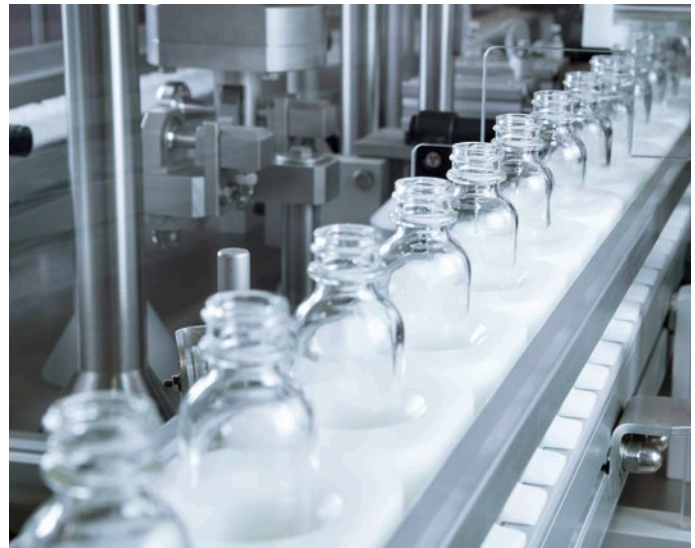
The transfer system of the lite-F is designed as a conveyor loop with and without pucks. An alternating gate can be adjusted to suit a wide range of container sizes.

says Stefan Winzinger. He adds: "And let's not forget the elegant design of the CP3912 panel, which accentuates the filling machine's style and quality."