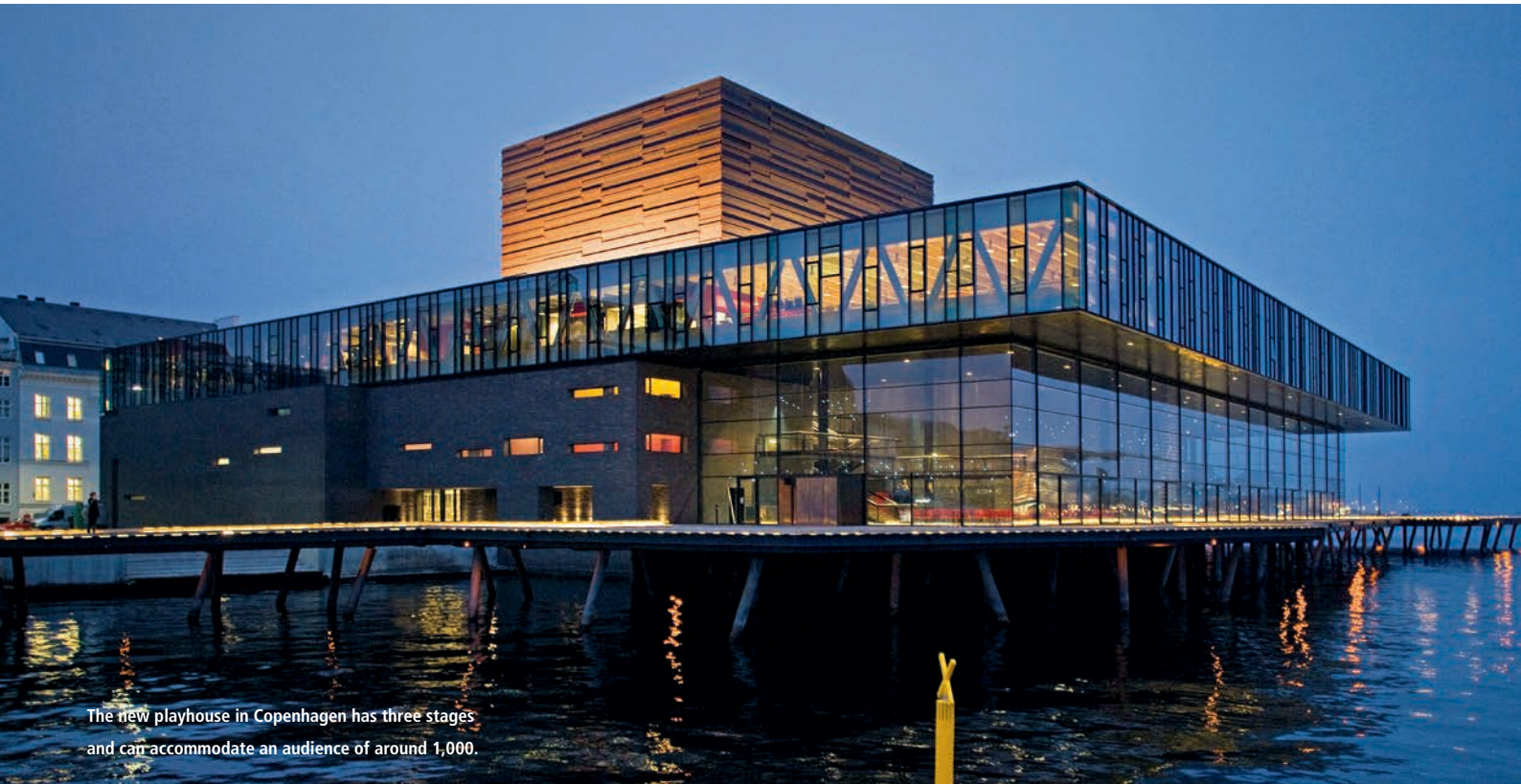
The new playhouse in Copenhagen has three stages and can accommodate an audience of around 1,000.

Automated stage technology at the Royal Danish Theater in Copenhagen