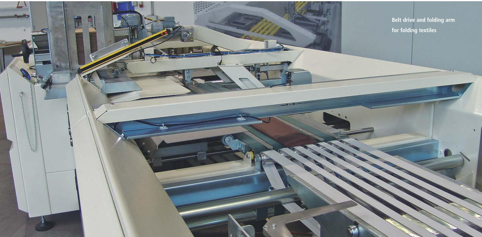
Belt drive and folding arm for folding textiles

Fully automatic textile folding, according to packaging designs specified by customers, needs to be very fast and highly accurate. In view of the large number of packaging designs and textile types, this is a complex task. The up and coming Swiss company espriTex GmbH builds and manufactures modern, versatile textile folding machines which can easily adapt to suit the very different requirements of their international customers. It is PC-based control technology from Beckhoff that guarantees the precision and speed of the folding machines.