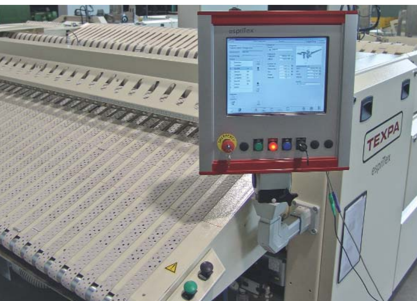
Modular espriTex folding machine with a Beckhoff touch screen Control Panel as the operating unit in a customer-specific configuration

Furthermore, safety I/O terminals are also integrated at the fieldbus nodes. "The Beckhoff TwinSAFE safety system provides another advantage with regards to our concept of a compact control architecture," according to Stebler. "The fact that most impressed us was that although the EtherCAT safety terminals can be easily integrated into the existing terminal strand, they represent an independent safety system in programming terms. Moreover, if necessary, detailed diagnostics can be carried out and made available to the operator at no great cost. This would be almost impossible with a conventional safety system."