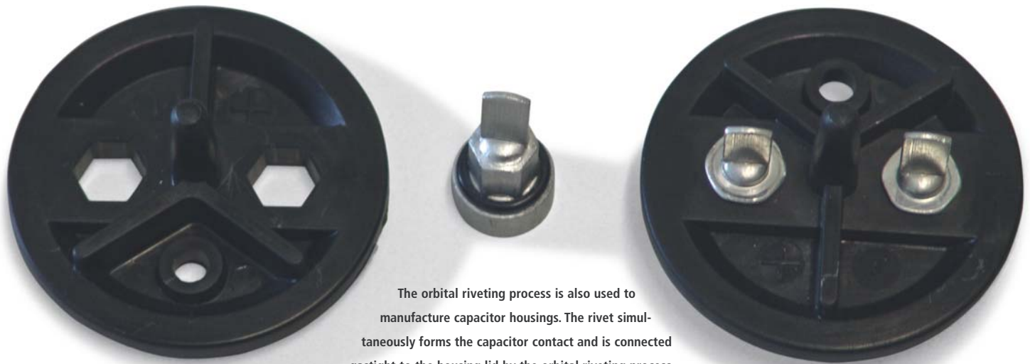
The orbital riveting process is also used to manufacture capacitor housings. The rivet simultaneously forms the capacitor contact and is connected gastight to the housing lid by the orbital riveting process.

KMT Produktions- und Montagetechnik GmbH, based in Villingen Schwenningen, Germany, manufactures production systems for special riveting processes. The company presented its modular machine concept for a CNC orbital riveter cell at the Motek 2010 trade show for assembling and handling technology. Equipped with a PC- and EtherCAT-based control platform from Beckhoff, the machine can cope with all customer requirements with regard to process speed.