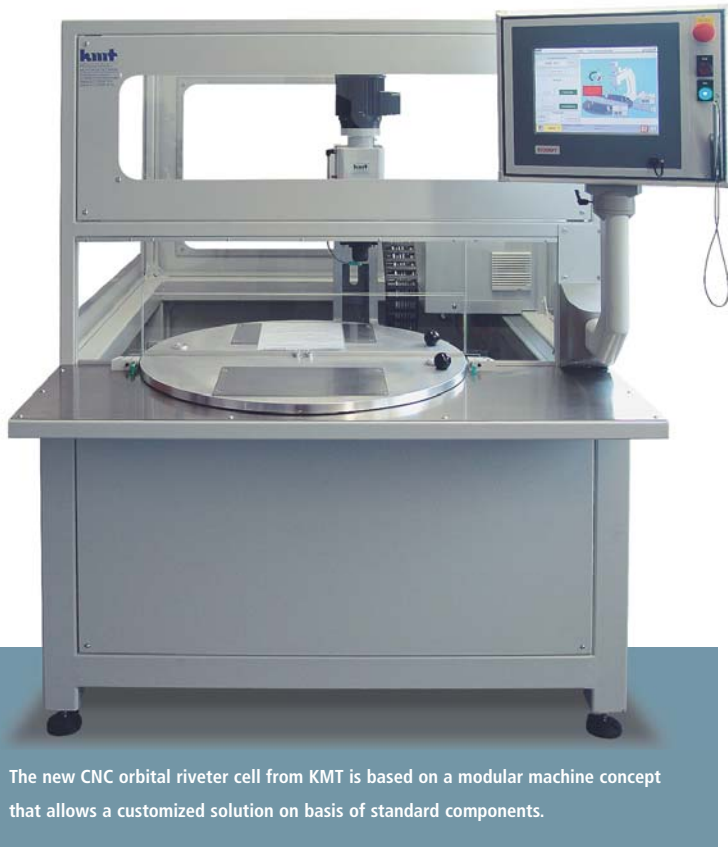
The new CNC orbital riveter cell from KMT is based on a modular machine concept that allows a customized solution on basis of standard components.

tive requirements and integrated into the production cell," explains Marc Heiter. "For example, the workpieces can be fed via a rotary indexing table or a swivelling unit. Alternatively, a workpiece carrier/transport system could also be used for this. The concept is also open with regards to the operation of the machine, which can be either manual or fully automatic."