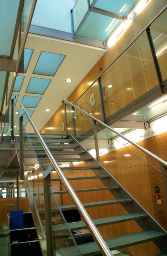
The daylight atrium is used as an internal communication zone.