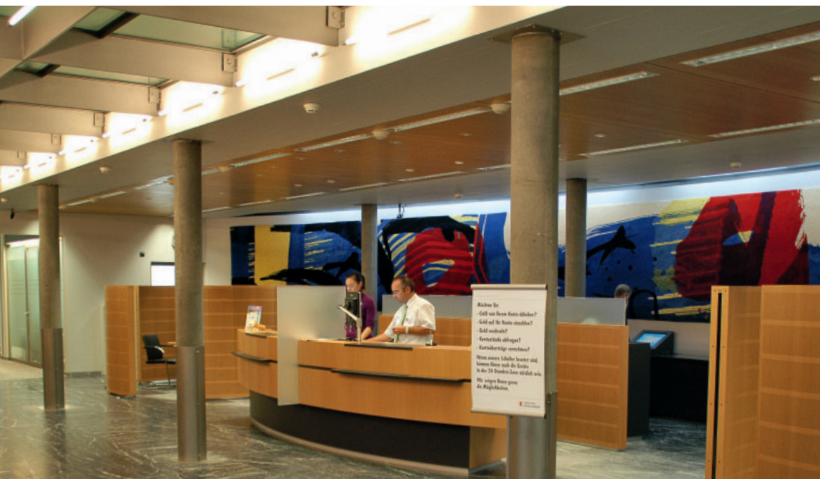
View of the customer service area at Appenzeller Kantonalbank

Head office of Appenzeller Kantonalbank in Appenzell. The extension (rear, left) subdivides the building complex into three architecturally equivalent parts. At the same time, the existing building was extensively refurbished.