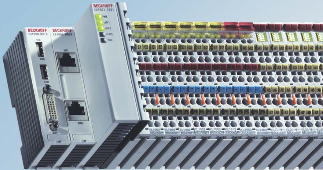
CX9000 Embedded PC

Beckhoff touch panel in the control cabinet wall for control system visualization