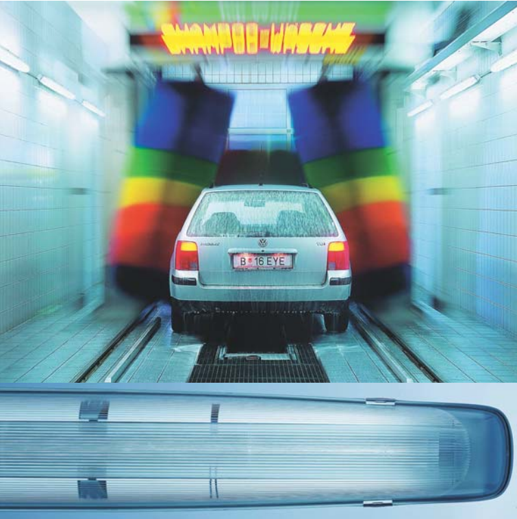
The oval and aerodynamic shape of the moisture-proof SCUBA luminaire family from Zumtobel breaks the linear monotony of conventional strip lighting.

In environments affected by moisture, dust and chemicals, SCUBA offers light yield and efficiency far beyond conventional moisture-proof luminaires.