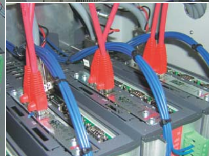
EtherCAT wiring on the Servo Drives