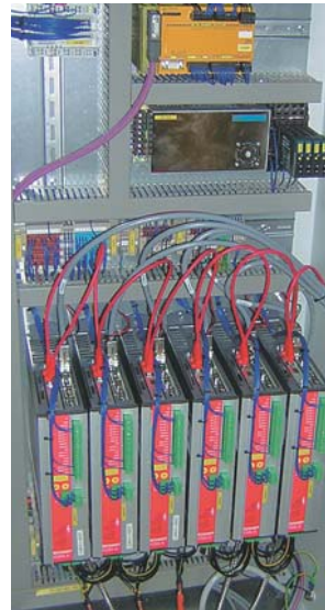
AX2006 Servo Drives connected via EtherCAT deal with torque control.