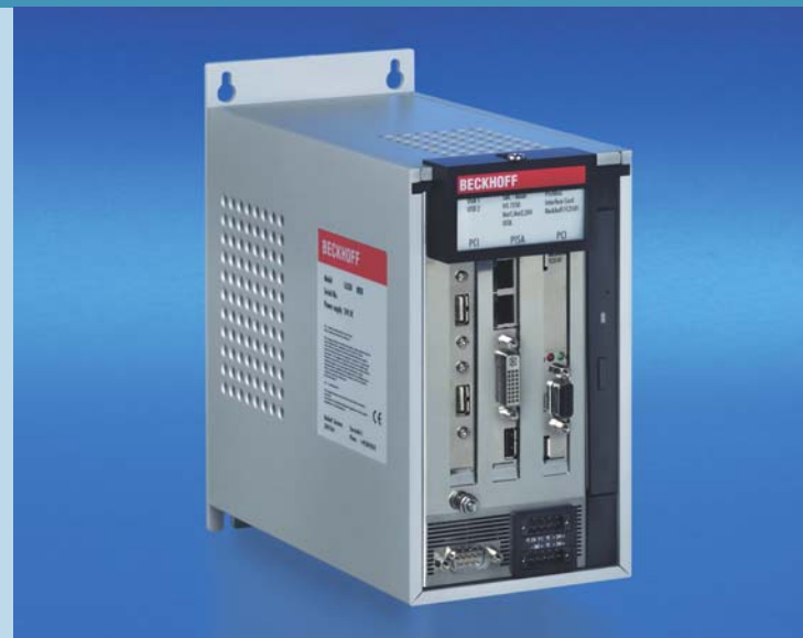
Beckhoff C6330 PCs as hardware platform for TwinCAT automation software.

Having abandoned PLCs in favor of PC-based control over seven years ago, Semicore has the experience to quickly recognize the quality industrial PC systems from the pretenders. The older PC-based Semicore systems used software coded in Flow Chart for control and in Visual Basic (VB) for Human Machine Interface (HMI). It was becoming apparent that the software platform Semicore once used was being treated as a legacy product by their vendor with little true advancement on the horizon. The software was also a substantial drain on CPU performance, causing maxed out PC processors with the inability to run other applications quickly or smoothly.