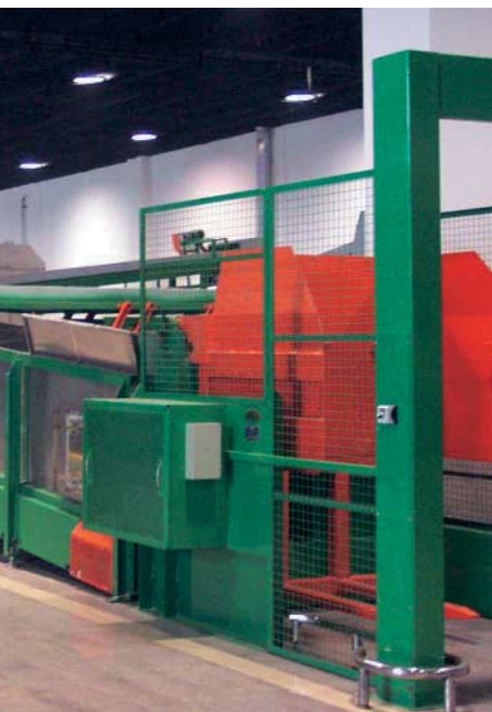
The Wuhu tobacco cutting line with a throughput of 8,000 kg of tobacco per hour.