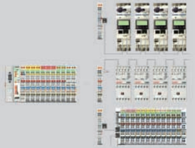
Bus Terminal system extension options: (top to bottom) Schneider Electric/Télemécanique TeSys model U, Beckhoff Power Terminal system, Terminal Bus extension system

Since May 2001, Beckhoff has focussed on expanding its OEM business. Key Account Manager Roland van Mark is responsible for this market segment. "The interfacing of the Schneider Electric/Télemécanique TeSys model U motor starter into the Beckhoff IP 20 fieldbus world bridges a significant gap. With its optimum price/performance ratio, the new Beckhoff module will influence numerous applications."